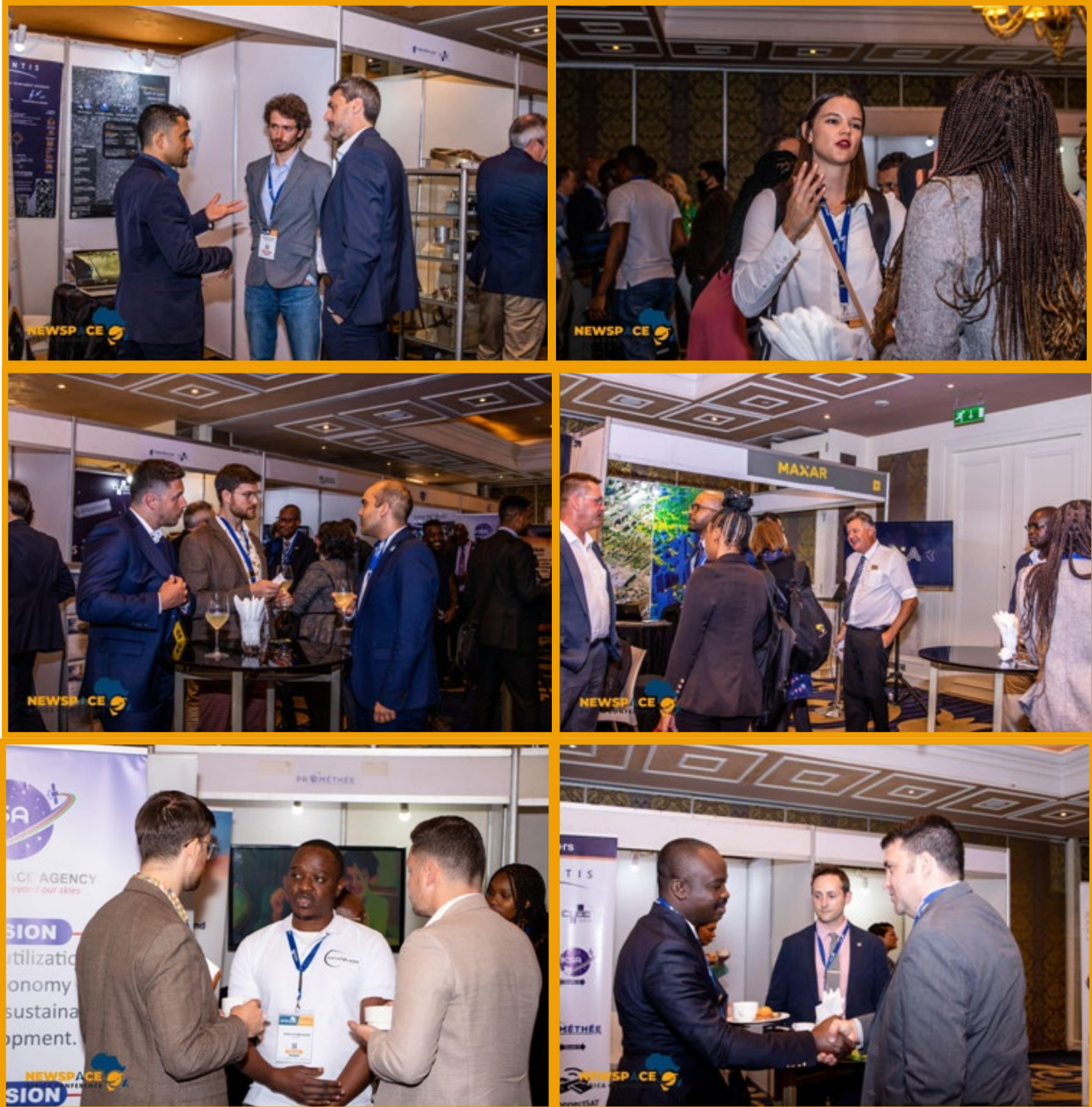
Attendees networking at the NewSpace Africa Conference 2022 exhibition