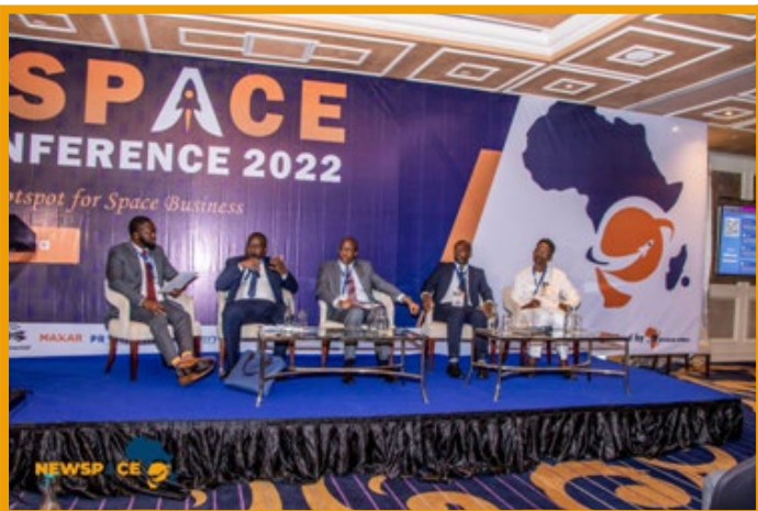
Heads of Space Agencies Panel - Day 1