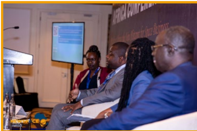
Innovations for connectivity - addressing the continent's digital