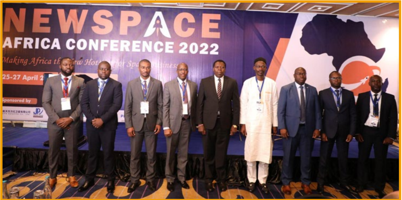
Heads of Space Agencies at the NewSpace Africa Conference 2022

With 45 speakers and over 100 delegates from 29 countries across four continents in attendance both virtually and physically, including Heads of Space Agencies from Nigeria, Kenya, Côte d'Ivoire, Namibia, Gabon, Rwanda, Egypt, Senegal, and Uganda, the conference program featured over 14-panel discussions and five keynote speeches