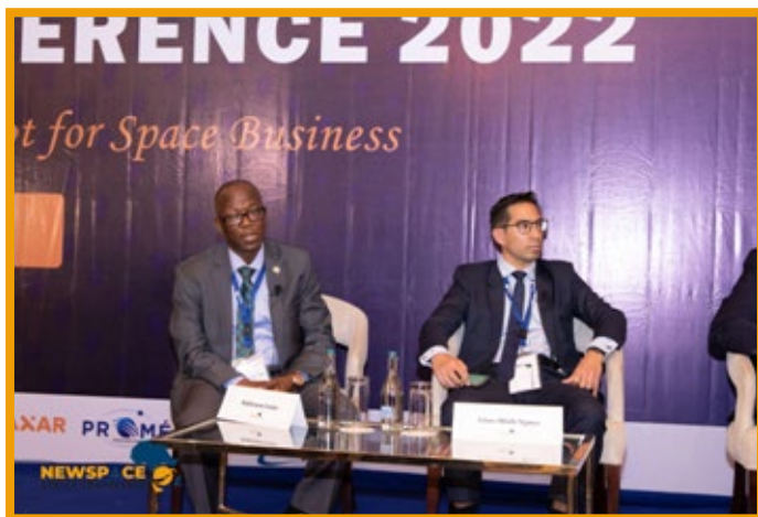
Newspace for satellite navigation and EO development