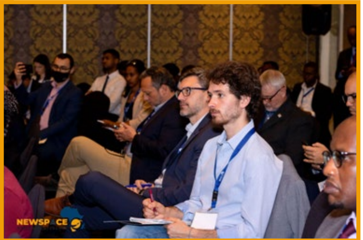
Attendees during panel discussions at the NewSpace Africa Conference 2022