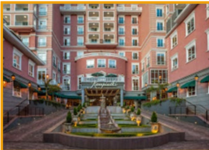
Villa Rosa Kempinski, Nairobi, Kenya

The conference was held at the prestigious Villa Rosa Kempinski Hotel, Westlands, Nairobi, Kenya, one of the choice meeting venues in the city.