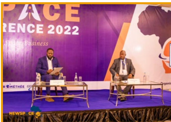
Heads of Space Agencies Presentation - Day 3