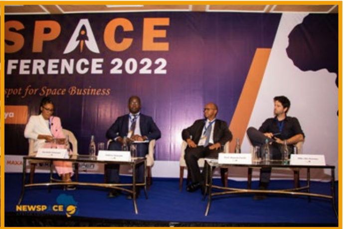
Industry outlook - growth projection