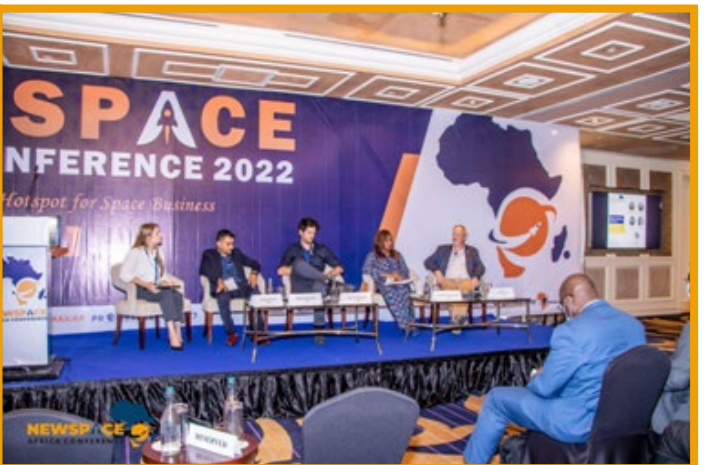
Newspace landscape in Africa - opportunities & challenges