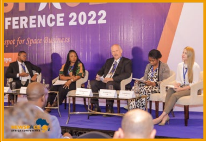
Roles of policies and regulations in accelerating industry growth.