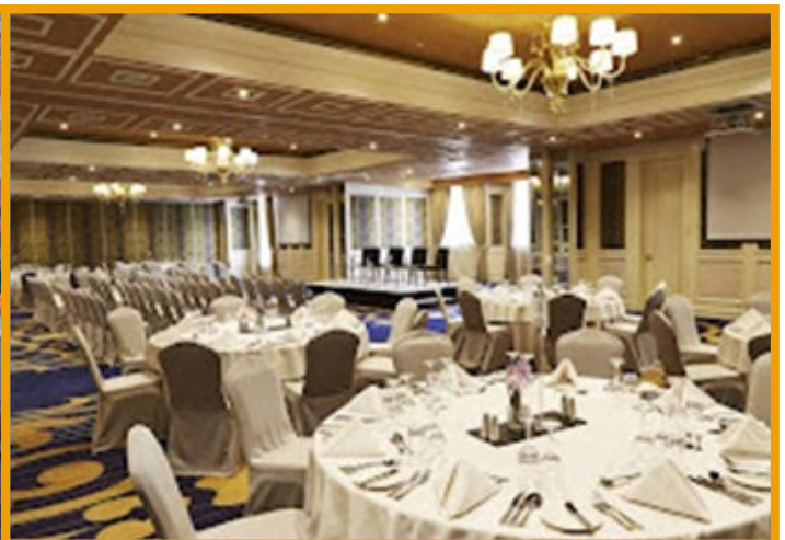
The NewSpace Africa Conference 2022 hall

The NewSpace Africa Conference 2022 is arguably one of the most notable pioneer events in Africa 2022, and this is evident in the social media reach and interactions the conference garnered. Search for the hashtags: #NewSpaceAfrica2022 #NewSpaceAfricaConference and see what comes up!