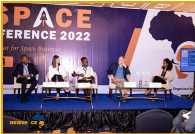
Small satellites - opportunities, risks and potentials for Africa