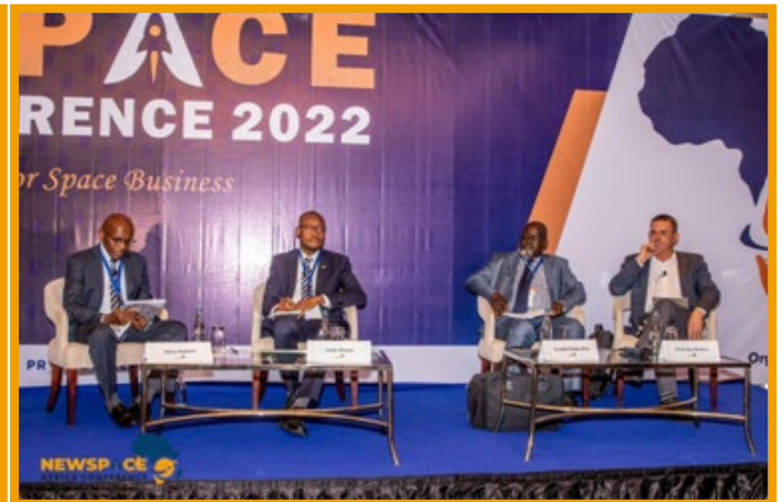
Addressing the talent gap in the African space industry divide