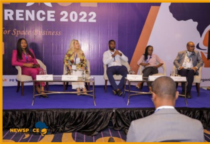
Doing business in Africa