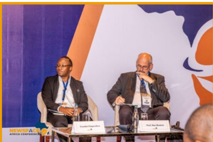
Investments and funding landscape in the ecosystem - opportunities, lessons learned