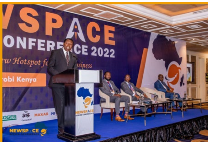
Honourable Eugene L. Wamalwa, Cabinet Secretary of Defence, Kenya giving his welcome address