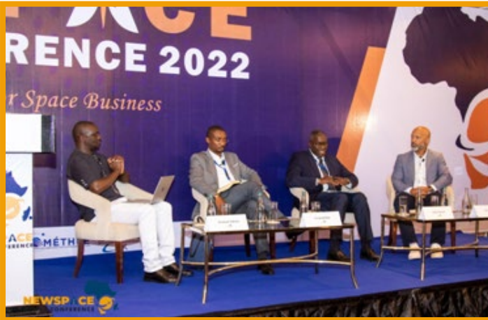
Accelerating public-private and international collaborations