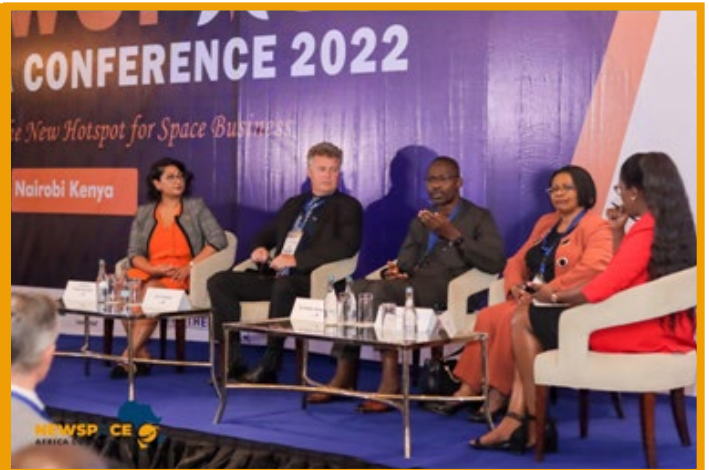
Space for sustainable development in Africa