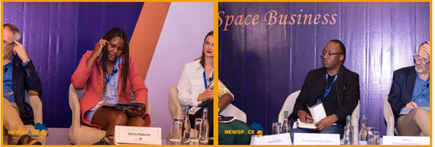
NewSpace Africa Startup Pitch Competition Judges

The startup pitch showcase of the NewSpace Startup Pitch Competition was physically completed at the conference. In addition, to better exploit the networking opportunities that the conference presented, a cocktail reception and a closing dinner were held during the conference.