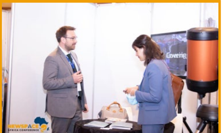
2022 Exhibitors of the NewSpace Africa Conference 2022